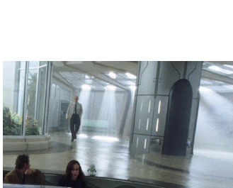
ARTIFICIAL INTELLIGENCE (2001)